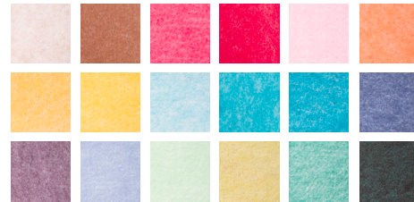
Light Beige, Chestnut, Red, Rose Red, Pink, Orange, Apricot, Yellow, Sky Blue, True Blue, Ocean Blue, Midnight Blue, Dark Purple, Purple, Seafoam Green, Moss Green, Green, Dark Green

Call us for leadtime on Premium Colors - 100 sheet minimum (typically ship within 8-12 weeks)